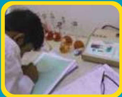
Analytical Chemistry Lab