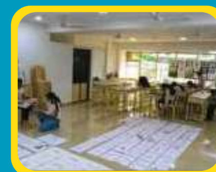
Visual Art Studio